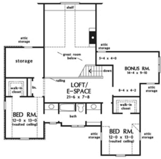
SECOND FLOOR PLAN PLAN NO. 1216